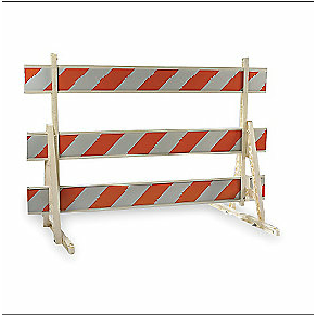
Typical Type 3 Barrier

1. Science Drive Closed for new hardscape and landscaping in Science Drive.