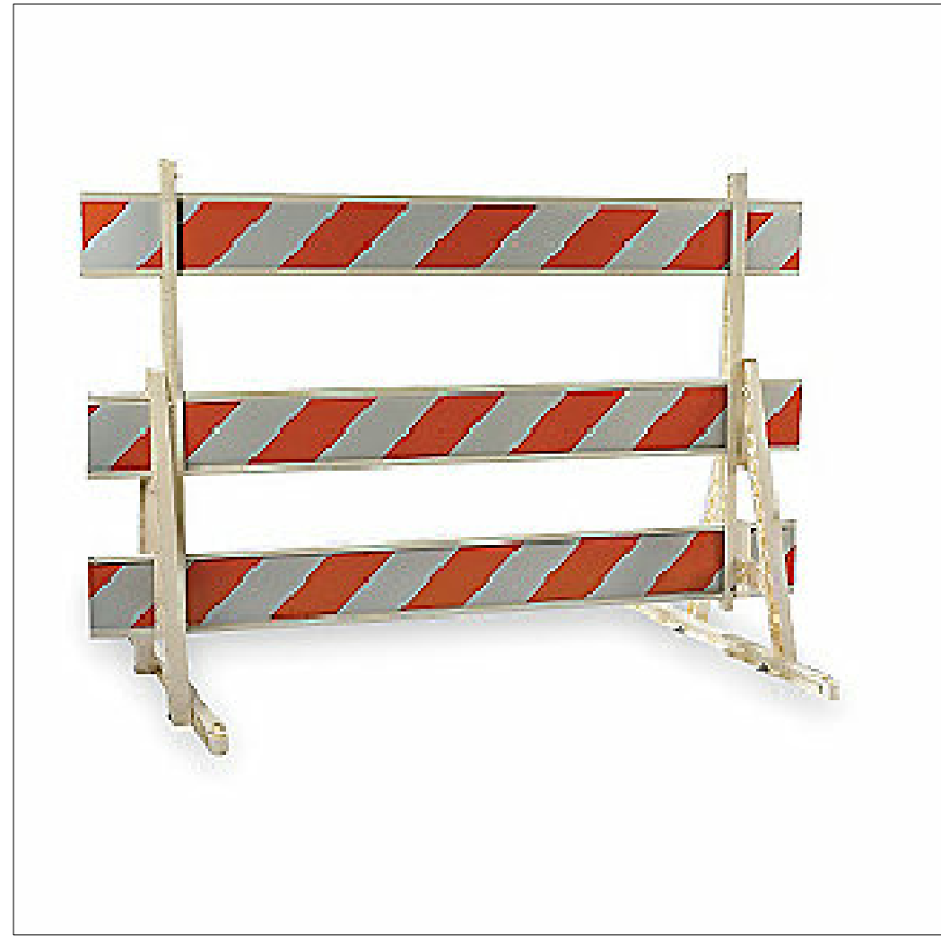
Typical Type 3 Barrier

1. Science Drive Closed for new hardscape and landscaping in Science Drive.